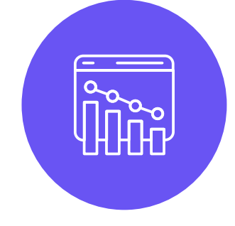
6% reduction in overall energy usage.