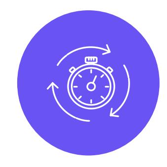
Improved time to market and expanded capacity needed to launch new products and service.