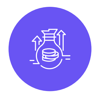
The bank regained its position as a top choice for digital consumer banking in Mexico.